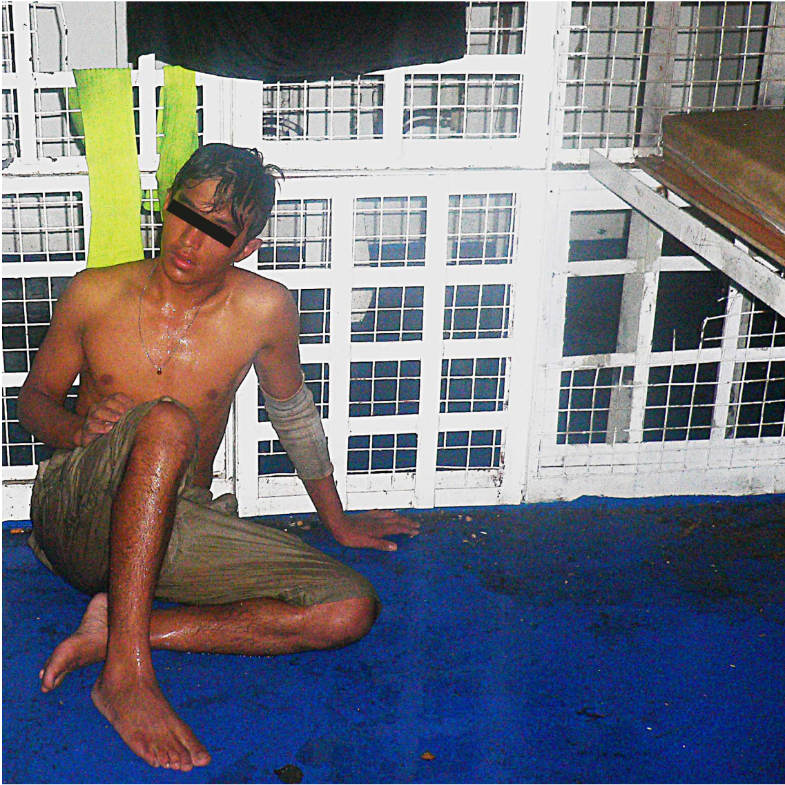
Readmission of unaccompanied minor