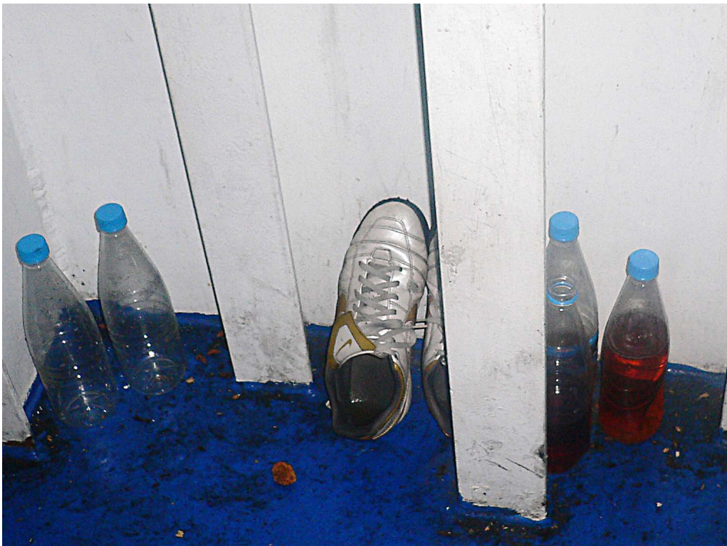
Lack of access to toilettes during readmission forces the people affected to urinate into bottles