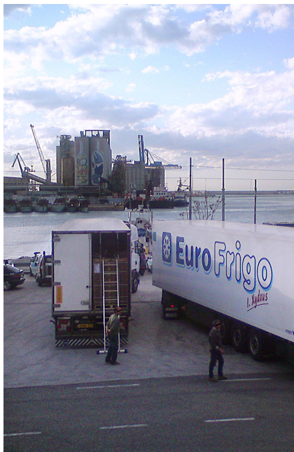
Control of trucks in the port of Ancona

Also two families, who reported to the Italian authorities that they have family members legally residing in other EU-countries, were not informed about the possibility to apply for asylum in Italy, thus, their right to family reunification under Dublin II. They were just readmitted back to Greece. GCR was contacted via mail by GUS organization, which requested support for the readmitted families in order to start the procedure of family reunification in Greece.